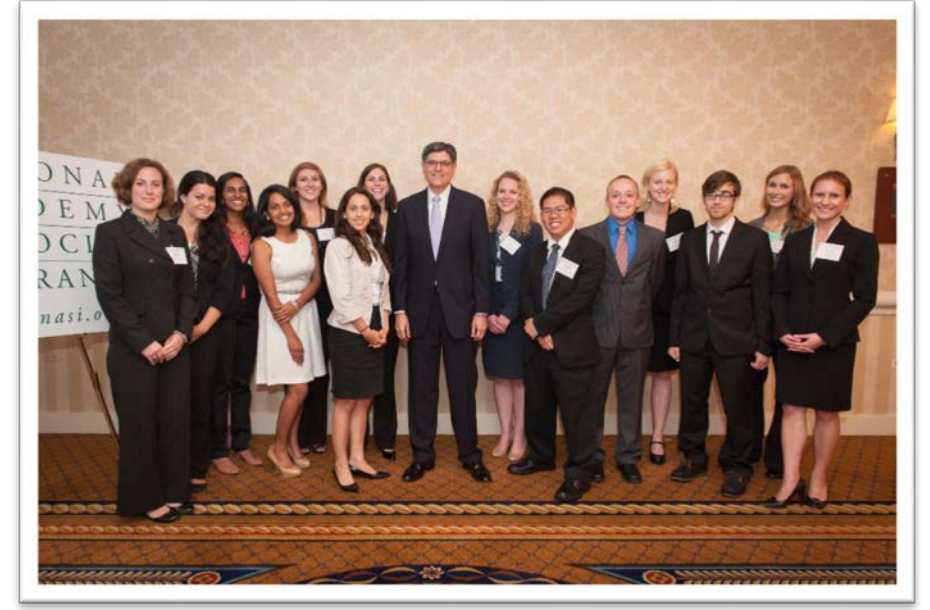
2013 Summer Interns with Treasury Secretary and Academy member, Jacob Lew, at the Robert M. Ball Award gala honoring Academy member, Alice Rivlin, for her outstanding contributions to social insurance.